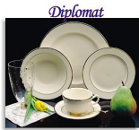
Ivory China With a Double Gold Band